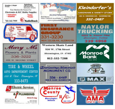
Don't forget to support our sponsors!

December 9 Annual Christmas Dinner/Meeting